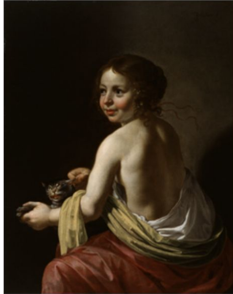
Girl Teasing a Cat

Jan van Bijlert (Dutch, ca. 1597-1671) Artist