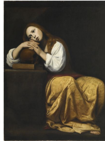
Saint Mary Magdalene

French (working in Savoy) Artist 1640s (Baroque) 37.259