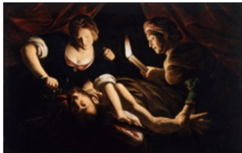
Judith Decapitating Holofernes

Pietro Rotari (Italian, 1707-1762) Painter ca. 1756-1762 ( Baroque ) 37.2377