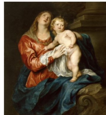
Virgin and Child

Carlo Francesco Nuvolone (Italian, 1609-1662) Painter ca. 1620-1662 ( Baroque ) 37.463