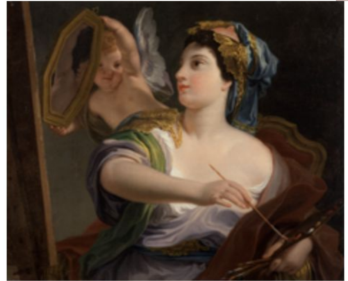
Allegory of Painting

Domenico Corvi (Italian, 1721-1803) Painter