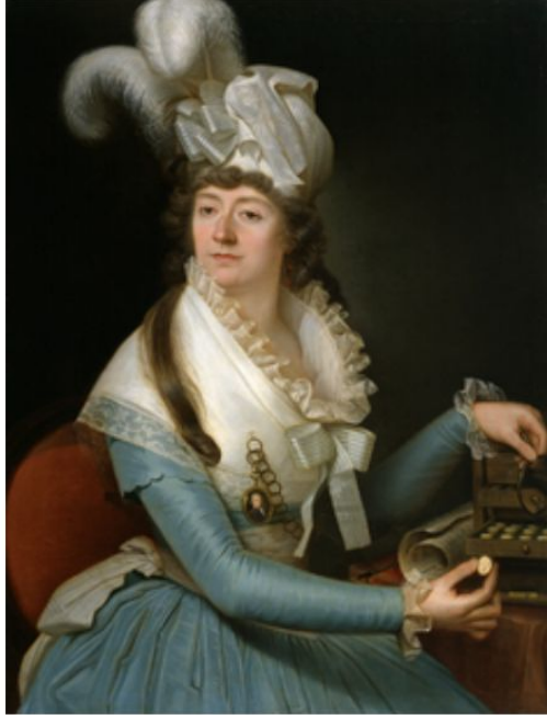
Portrait of a Lady