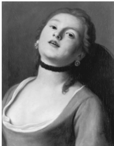
Young Russian Woman

Pietro Rotari (Italian, 1707-1762) Painter ca. 1756-1762 ( Baroque ) 37.2377