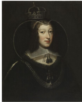
Portrait of Christine of France, Dowager Duchess and Regent of Savoy

Circle of Elisabetta Sirani (Italian, 1638-1665) Artist 1638-1665 (Baroque) 37.253