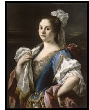
Portrait of a Noblewoman

Italian (Rome) Artist ca. 1710 (Baroque) 37.400