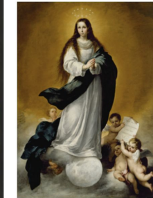
The Virgin of the Immaculate Conception

Justus Sustermans (Flemish, 1597-1681) Artist 1654 (Baroque) 37.330