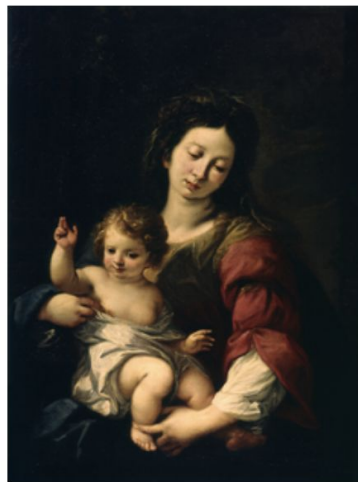
Madonna and Child

Carlo Francesco Nuvolone (Italian, 1609-1662) Painter ca. 1620-1662 ( Baroque ) 37.463